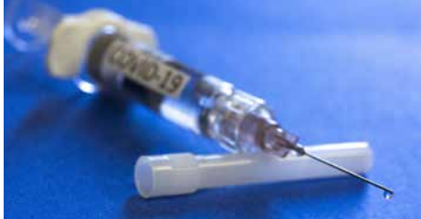
A vaccine will clearly help rebuild investor confidence

The decisions made over the coming weeks will likely shape all our lives for the next multi year period. The critical Covid numbers are now just under 7 million cases around the world with 400,000 deaths and 50% of those now in the Americas, where numbers continue to rise. 216 countries around the world are affected. Deaths continue to reduce in the European area though China still has spikes appearing that are quickly dealt with through regional lockdowns – I suspect something we will have to get used to here in the coming weeks. Clearly, commerce – both here and around the world – needs to start working again soon. Sensible economics will drive prosperity and of course tax revenue and, as we all recognise, money makes the world go around.