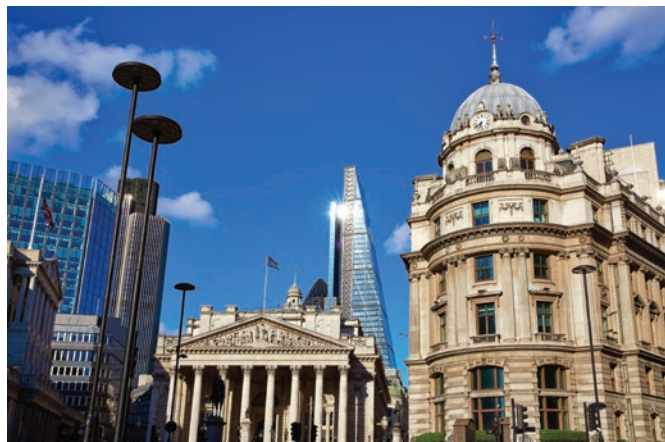
The UK stock market offers relative value

Our own UK market remains relatively undervalued against the US and other major markets, with the FTSE 100 on a PE ratio of 12.9 times and a dividend yield of 3.8%. In my view, once we emerge from the extended Brexit fiasco, the UK market is likely to get a positive re-rating.