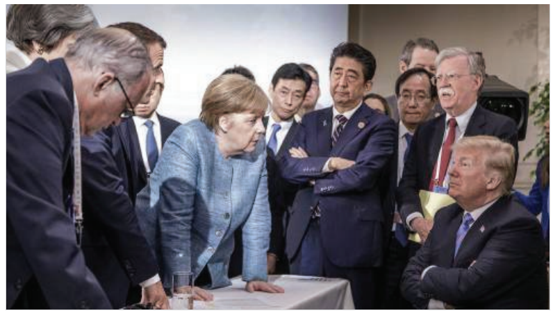
Trump - 'No tariffs no barriers. And no subsidies'

While his policy lurches capture headlines, the real story is that the multilateral trading system has been under pressure for some time from deep structural changes in the global economy, namely the rise of China, the shift to a digital economy and the economic and political disruption those two changes have brought. I think Trump recognizes this and that his way of achieving the 'right' result in the end is not to appease the status guo but to force progress with his unique style of radical policy delivery and extreme change. This results in immediate political debate and then policy change will come. That is the President's view - he ultimately wants a level playing field. We will see - and love him or loathe him, he is getting things done.