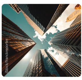
PROPERTY AND BANK ACCOUNTS

How your residence status defines the way you are taxed on income, gains and inheritance