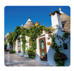
TAX AS A NON-RESIDENT

How your residence status defines the way you are taxed on income, gains and inheritance