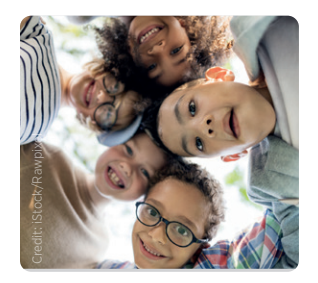
HOW INHERITANCE TAX WORKS

How establishing LPAs can make things simpler for your loved ones