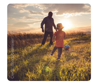
MAKING YOUR PLAN

Navigating the complex rules surrounding inheritance tax