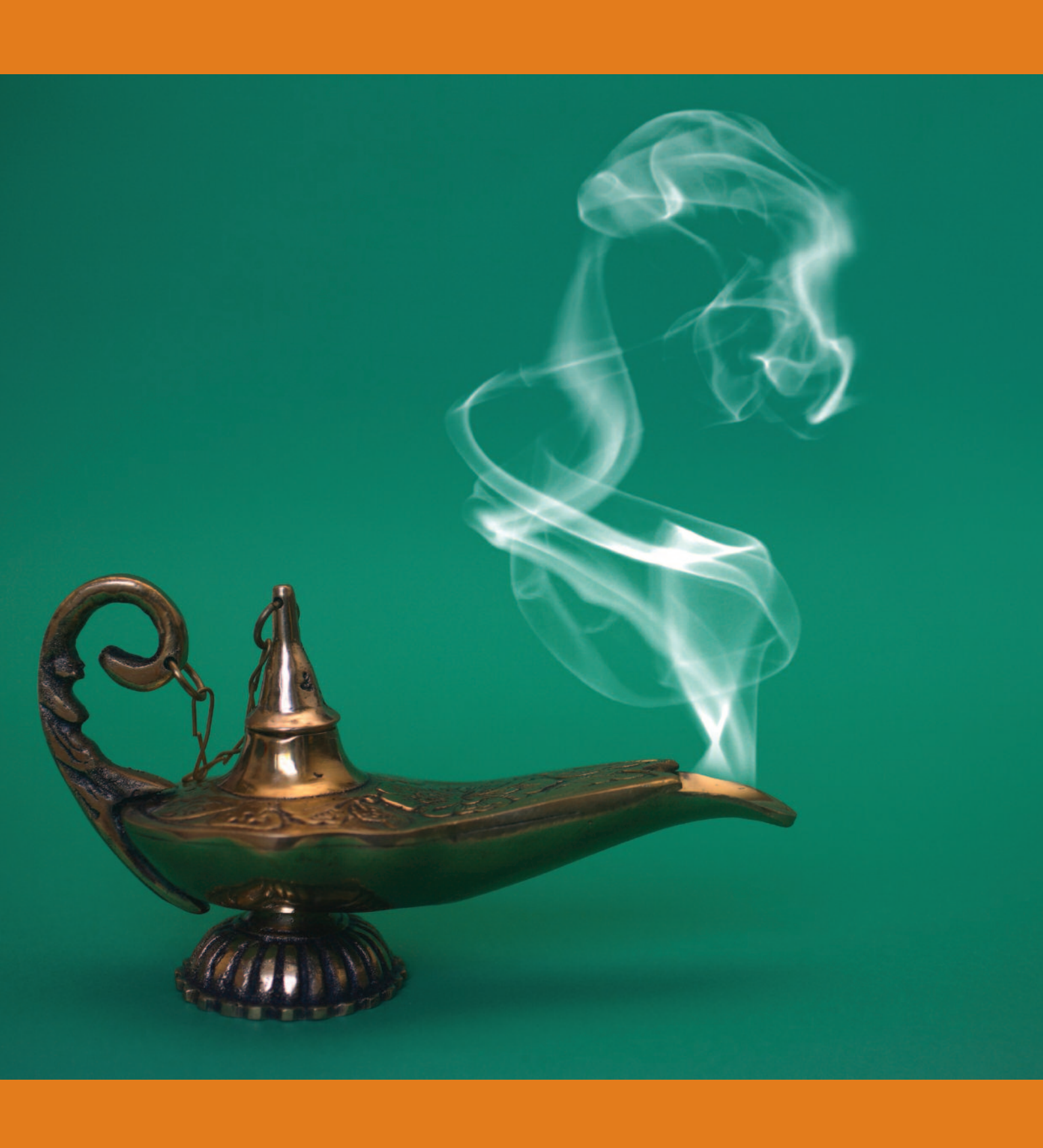
What did the Chancellor conjure up?